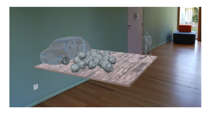
Figure 2: Miniature view of an ARwav, with a car and standing man silhouette as reference points.

tackle the potential layout issues and people flow abundance, we developed a 1:10 scale scene showing ARwavs, see Figure 2. This mini mode allow observers to see the entire ARwav without having to move their head or step back. This version will not be showed systematically, but will be if it is appropriate within the discussion with the tester or if it is more convenient due to the layout business. Not only this version tackles layout limits but it also fits Hololens