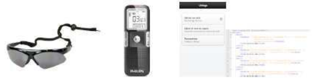
a. Sunglasses camera b. Recorder c. Logging/Tracing tools

In the sequence, participants were asked to think aloud and they received a smartphone (either IOS or Android, accordingly to their familiarity with one of these platforms). They were asked to wear sunglasses with a camera, so that it was possible to determine where they were looking at. Figure 2 illustrates the materials used for collecting user traces during the user testing which included a sunglasses camera, a voice-recorder and a logging tool.