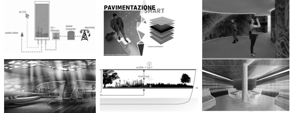
Fig. 1. Selection of case studies from university activities: (a) Indoors with solar leaf panels, (b) Indoors with smart floor, (c) Feel the cities, (d) Glowrious, (e) The floating forest, (f) Heckquilibrium.

Case studies have been collected in a theoretical sampling (Eisenhardt, 1989) based on a cruise vessel & yacht cluster with smart features. The sampling includes 10 global cruise companies registered in CLIA (Cruise Lines International Association) (CLIA, 2020b) with the presence of smart ships (Vafeidou, 2019) and of 4 yacht companies with the presence of smart yachts, and on the domain of environmental sustainability, which regards the respect of different ecosystems such as in historical tourism, sea, sand and sun tourism (UNEP & WTO, 2005). Fourteen case studies from Cruise Industry, three from Yacht Industry, five from university courses on cruise design and three from university courses on yacht design have been collected from January 2020 to January 2021.