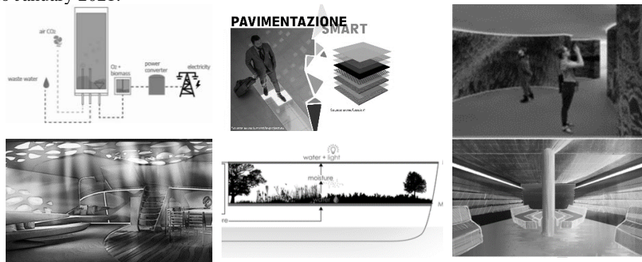
Fig. 1. Selection of case studies from university activities: (a) Indoors with solar leaf panels, (b) Indoors with smart floor, (c) Feel the cities, (d) Glowrious, (e) The floating forest, (f) Heckquilibrium.

Case studies have been collected in a theoretical sampling (Eisenhardt, 1989) based on a cruise vessel & yacht cluster with smart features. The sampling includes 10 global cruise companies registered in CLIA (Cruise Lines International Association) (CLIA, 2020b) with the presence of smart ships (Vafeidou, 2019) and of 4 yacht companies with the presence of smart yachts, and on the domain of environmental sustainability, which regards the respect of different ecosystems such as in historical tourism, sea, sand and sun tourism (UNEP & WTO, 2005). Fourteen case studies from Cruise Industry, three from Yacht Industry, five from university courses on cruise design and three from university courses on yacht design have been collected from January 2020 to January 2021.