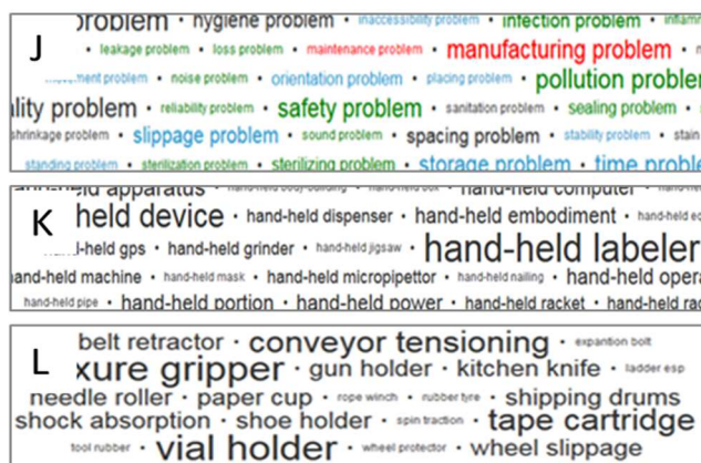
Fig. 5. Text pattern J. problems, K hand-held * and L slippage problem

‘easy’ and ‘hold’ in Title Abstract and Claims. In this way, one can easily extract hand-held devices with a pattern ‘hand-held’ noun, as some examples given in Fig 5.K. below.