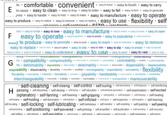
Fig. 2. Text pattern results E. Interface patterns F. Easy to verb:* G. *ility and H self-*

Convenience [49] concerns how the interaction ‘feels’ or interfaces with the solution. A more appropriate grouping for usability, learnability and portability, [51, 52] is the term ‘interface’, as this is wider than ‘convenience’. The textual patterns of ‘interface’ are easy to verbs * or text patterns with * ability , * llity , self .* and overwrites like user-friendly , convenient , comfortable . Fig 2.E depicts the textual pattern for interface. As the interface is all about making the user experience easier, a text pattern ‘easy to’ identifies elements of convenience, for example, easy to open, easy to apply, easy to brush, easy to operate, easy to adjust, easy to rinse, easy to store, easy to transport,