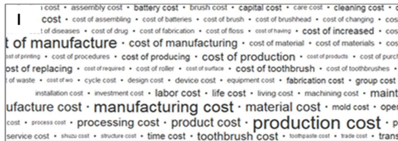
Fig. 3. Text pattern cost of * and * cost

Price [49] relates to financial value. However, the cost of a solution can include; cost to obtain, cost to run [52], cost of production etc. A more appropriate category name than price is 'cost'. It is economical innovation; adding value by reducing cost. The patterns are simply cost of noun: * and * cost as depicted in Fig. 3.