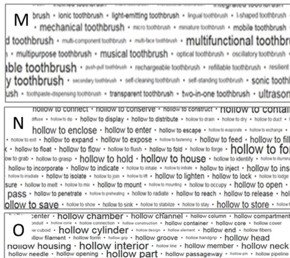
Fig. 7. M. adjective:* toothbrush N hollow to verb:* and O hollow noun:*

Fig 7.O shows hollow components in the toothbrush patent pool. Ten other 10 property variations were similarly distilled in there adjective – verb, property – function relationships. They are segmentation, surface, shape, flexibility, pulsation, state, integration, senses, transparency and automation .