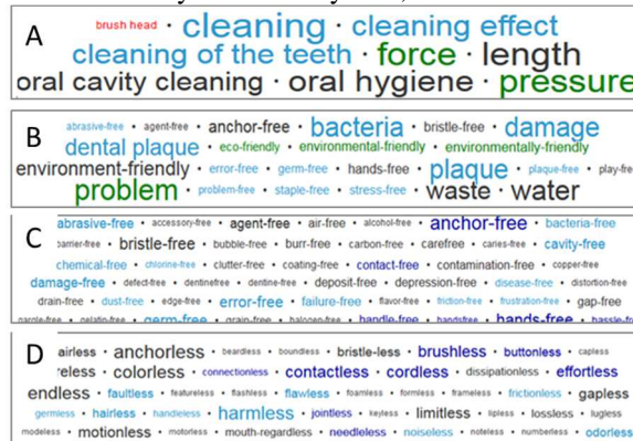
Fig. 1. Text pattern results A. Performance patterns B. Harm patterns C. *-free and D. *-less

Overwrites including environmentally friendly, pain, noise, problem, harm, fault, are shown in green. The pattern includes a second text group namely the adjectives ending with *less, *free e.g. germ-free. The term in term-free is often a harm that has been eliminated in the proposed patent. The result of a *-free pattern search is shown in Fig 1.C. A similar text pattern that can help to extract harm elements in a patent pool is *less, shown in Fig 7. Both *free and *less are related to the TRIZ ideality approach which claims: the ideal system is no system, but the function remains.