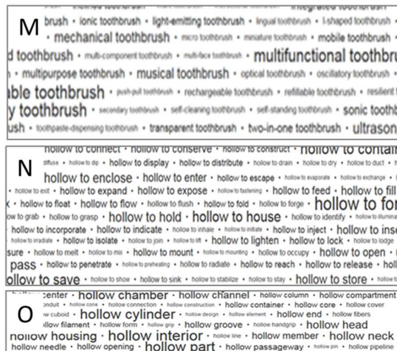
Fig. 7. M. adjective:* toothbrush N hollow to verb:* and O hollow noun:*

Fig 7.O shows hollow components in the toothbrush patent pool. Ten other 10 property variations were similarly distilled in there adjective – verb, property – function relationships. They are segmentation, surface, shape, flexibility, pulsation, state, integration, senses, transparency and automation .