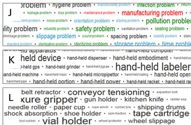
Fig. 5. Text pattern J. problems, K hand-held * and L slippage problem

‘easy’ and ‘hold’ in Title Abstract and Claims. In this way, one can easily extract hand-held devices with a pattern ‘hand-held’ noun, as some examples given in Fig 5.K. below.