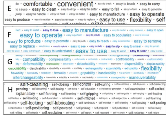
Fig. 2. Text pattern results E. Interface patterns F. Easy to verb:* G. *ility and H self-*

Convenience [49] concerns how the interaction ‘feels’ or interfaces with the solution. A more appropriate grouping for usability, learnability and portability, [51, 52] is the term ‘interface’, as this is wider than ‘convenience’. The textual patterns of ‘interface’ are easy to verbs * or text patterns with *ability , *ility , self-* and overwrites like user-friendly , convenient , comfortable . Fig 2.E depicts the textual pattern for interface. As the interface is all about making the user experience easier, a text pattern ‘easy to’ identifies elements of convenience, for example, easy to open, easy to apply, easy to brush, easy to operate, easy to adjust, easy to rinse, easy to store, easy to transport,