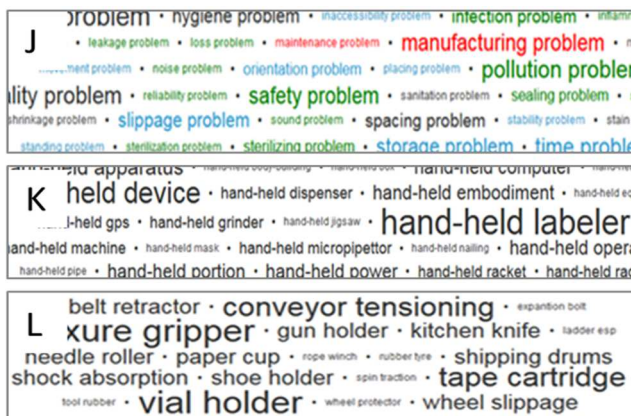
Fig. 5. Text pattern J. problems, K hand-held * and L slippage problem

‘easy’ and ‘hold’ in Title Abstract and Claims. In this way, one can easily extract hand-held devices with a pattern ‘hand-held’ noun, as some examples given in Fig 5.K. below.