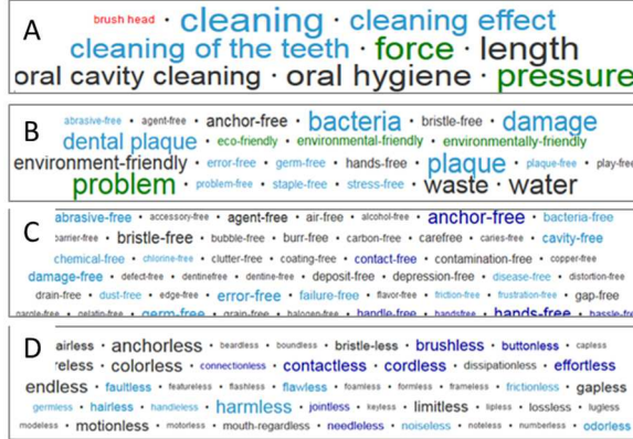
Fig. 1. Text pattern results A. Performance patterns B. Harm patterns C. *-free and D. *-less

Overwrites including environmentally friendly, pain, noise, problem, harm, fault, are shown in green. The pattern includes a second text group namely the adjectives ending with *less, *free e.g. germ-free. The term in term-free is often a harm that has been eliminated in the proposed patent. The result of a *-free pattern search is shown in Fig 1.C. A similar text pattern that can help to extract harm elements in a patent pool is *less, shown in Fig 7. Both *free and *less are related to the TRIZ ideality approach which claims: the ideal system is no system, but the function remains.