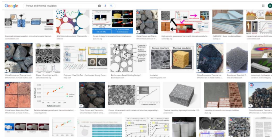
Fig.5. Search results for a pair of attributes.

The following image illustrates the search process for an attribute pair. In this example, the attributes “Porous” and “Thermal insulation” were searched together. It is possible to observe that some of the results provided were: light concrete, styrofoam sheets, bricks, plumbing pipes, among others.