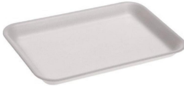
Fig.1. Typical Styrofoam tray.

Considering that SMIROSG and Product DNA are the only methods that have a systematic approach and include a practical tool easy to be applied by product development teams, we decided to investigate these methods in greater depth. Two papers present practical applications of SMIROSG: that of Verhaegen et al. [3] and that of Frazão et al. [1]. The practical application of Product DNA is demonstrated in the article by Dewulf [2]. From the applications, it appears that both methods have great potential for reuse. The next questions are: how effective is each one? Are there possibilities for complementarity between the methods? Are there possibilities for improving these methods? Considering these research questions, a comparative analysis is necessary. To this end, it was decided to focus on a very common type of solid waste: the Styrofoam tray (Figure 1). This type of tray has many uses, but it is most often employed to store cold cuts and meats. The final destination of this waste is problematic since Styrofoam is known to be difficult to recycle [7].