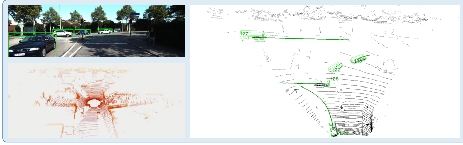
Fig. 1. Proposed 3D detection and tracking coupling system result. Left top image and left bottom image shows the 2D detection results and the raw points cloud as input. Right image shows the 3D detection and multi-object tracking result. Objects’ trajectories are represented as deep green curve, green numbers are IDs of each object.

and LiDAR, the object’s RGB texture information and position information in 3D space can be obtained at the same time and the accuracy of object detection can be enhanced.