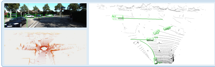
Fig. 1. Proposed 3D detection and tracking coupling system result. Left top image and left bottom image shows the 2D detection results and the raw points cloud as input. Right image shows the 3D detection and multi-object tracking result. Objects’ trajectories are represented as deep green curve, green numbers are IDs of each object.

and LiDAR, the object’s RGB texture information and position information in 3D space can be obtained at the same time and the accuracy of object detection can be enhanced.