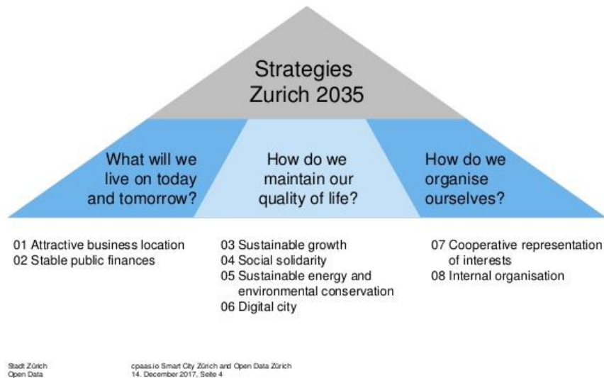
Fig 2. Strategies Zürich 2035 [11].

Importantly, the strategy is long-term and is continued by successive local governments. What matters is the good of the city and the community, rather than the particular interests of politicians. The first question focuses on what we are doing now and what we will be doing in the future. For Zürich, the financial stability of the city and its inhabitants is extremely important. The city's financial stability and an attractive location for doing business have an impact on credibility and stability (investors decide to open companies in a city that is predictable and stable in terms of politics). The second question concerns caring for the quality of life and choosing the right paths of sustainable development, creating social sensitivity and solidarity, proper use of energy and digitization of the city. The third question "How do we organize ourselves" concerns the wider community surrounding the city, international contacts, perception of the agglomeration in the world, cooperation with business entities located in other cities and countries.