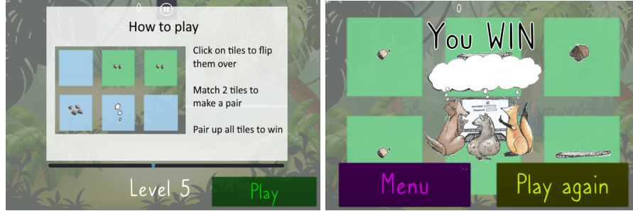
Fig. 4. Wolf, Hyena and Fox game

permanently. The images are spread randomly between the tiles and each tile has exactly one match. The goal of this game is to match each tile with an identical tile. There is no scoring in the game and, therefore, it cannot be lost. The game is an exercise in memory and the theme of the message of the game is to remember the passwords that one creates. The number of tiles increase if a higher difficulty level is selected.