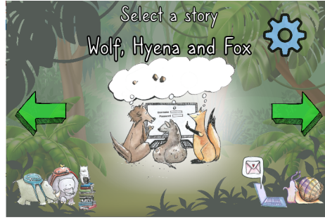
Fig. 1. Application main menu

The game starts with the main menu which serves as a selection screen for choosing a story scene which includes a poem and related quiz and game to be played. A screenshot of the main menu scene is given in Figure 1. The two green arrows pointing left and right are used to navigate through the poems. The story currently shown is that of Wolf, Hyena and Fox as shown in the center of Figure 1, and is an animation that can be selected. When this part of the screen is tapped, focus will be switched to the chosen story.