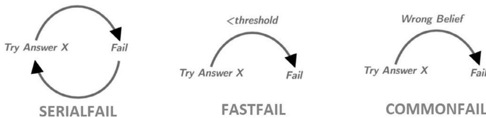
FIGURE 2 A visual representation of the three proposed RI variable SERIALFAIL, FASTFAIL, COMMONFAIL