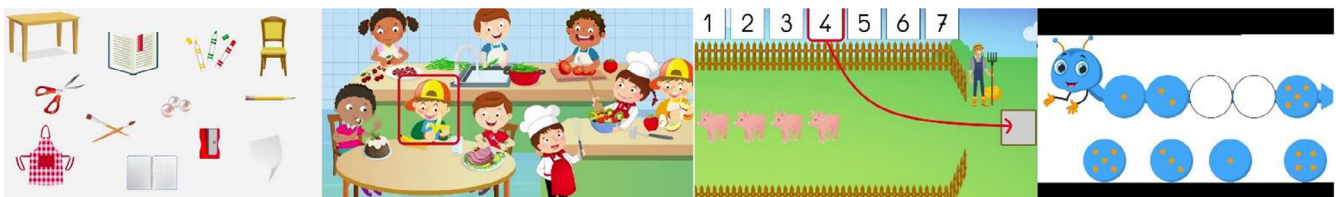
FIGURE 1 Screenshots of the app. The two first pictures correspond to activities of early literacy and the others to activities of early numeracy.

Some recent studies show that the components of executive functioning can be dissociated (Lonigan et al., 2016; Miller et al., 2012) and predict different educational outcomes (McClelland et al., 2014). The three components of executive functioning develop in a significant and linear fashion during childhood. The preschool years are considered an important period for the development of executive functioning because of the rapid changes in the prefrontal cortex between the ages of 2 and 5 (Zelazo & Müller, 2011). Several authors suggest that RI and WM develop first, and then allow for the development of CF (Best & Miller, 2010; Diamond et al., 2002; Garon et al., 2008).