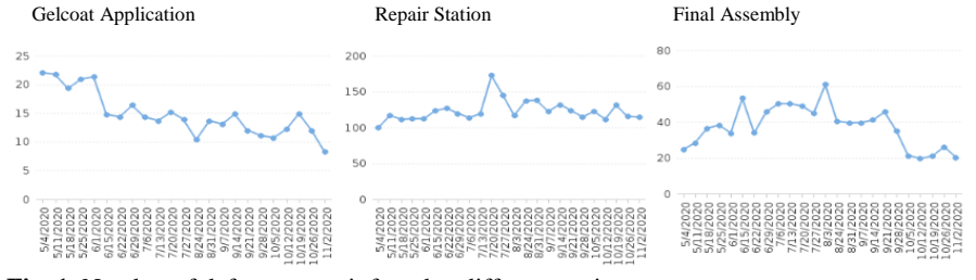
Fig. 1. Number of defects per unit found at different stations.

The high number of defects. Due to the results of the VSM, it was decided to analyse the defects caused throughout the process, the areas where they were most significant and the operations that originated them. Through the analysis of audits and quality reports carried out by the company, it was identified in which station the defects usually appear. Unequivocally, it was concluded that most of these were located in the Repair station. Through several graphs, provided by the company, presented in Fig. 1 (period of 6 months), it was possible to verify that the Repair station had an average of 120 defects per unit (DPUs), a value much higher than the other sections.