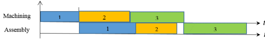
Fig. 4. Gantt chart of the "frame" schedule for the manufacture of components and assembly of products from them.

In this case, knowing the times of manufacturing the "frames" of components and the assembly times of batches of products from them, it is possible to construct a time-optimized "frame" assembly schedule for several batches of various products, if we consider the manufacturing time of the "frame" of components for assembling the i^{\text{th}} batch of products through A_i as the processing time of the i^{\text{th}} detail on the first machine, and the assembly time of this batch of products on the conveyor through B_i as the processing time of the i^{\text{th}} detail on the second machine, then this problem turns out to be similar to Johnson's [4] (see Fig. 3).