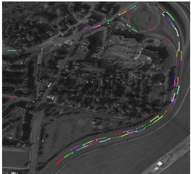
Fig. 3. Sample enhanced GM-PHD result.

filter. Fig. 3 shows a sample output of our object detection and GM-PHD filter method.