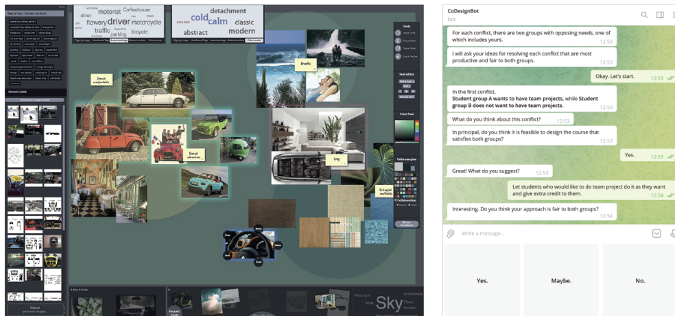
Figure 1: Examples of human-AI collaborative ideation systems. An intelligent design tool helping users design a mood board (left) [9] and a chatbot assisting consensus-building (right) [18].

studies often show AI’s capabilities to contribute to ideation, open questions remain how intelligent systems can support collaborative ideation among people, e.g.: What would users want from AI systems and what would users want from humans despite AI’s capability in doing the same?