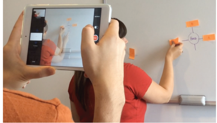
Figure 3: Ideation techniques in this workshop. Examples of Dialogue-Lab activities (left) [13] and video prototyping (right) [14] from the authors' research.

unique topics (Figure 3 left). Pairs of participants will cycle around the stations for a discussion, focusing on one topic at a time.