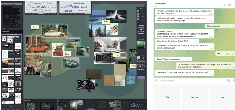
Figure 1: Examples of human-AI collaborative ideation systems. An intelligent design tool helping users design a mood board (left) [9] and a chatbot assisting consensus-building (right) [18].

studies often show AI’s capabilities to contribute to ideation, open questions remain how intelligent systems can support collaborative ideation among people, e.g.: What would users want from AI systems and what would users want from humans despite AI’s capability in doing the same?