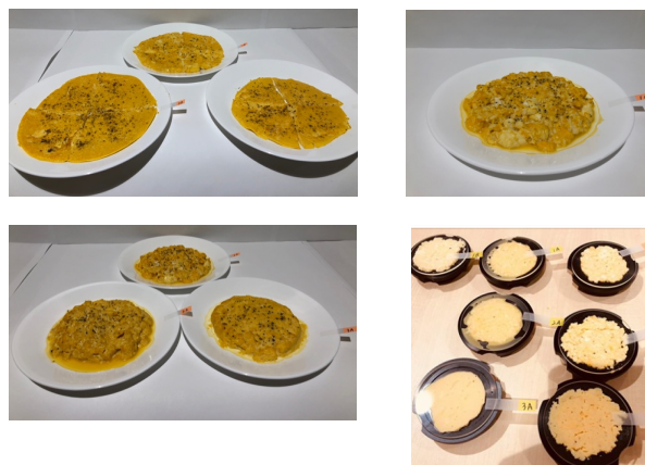
Figure.3 Cooking results of “Fuhafuha Tofu”.

uniquely determined is set as explanatory variables. In the estimation of explanatory variables, we focus on the following two perspectives. One is the existence of a quantitative expression for the foodstuff. Quantitative amount for a foodstuff can be set as an explanatory variable, if the required input of the foodstuff is not specifically specified. The second is the presence or absence of degree expressions for the cooking and processing operations. We focus on the time required for the cooking and processing operations, and the amount and intensity of the operations. For example, the heating time and heat level in the heating process, and the degree of force and stirring time in the stirring process. Here, we add that even if the specific amount and degree of manipulation are not described as quantitative expressions, the state of change of the food after the cooking and processing operation can be described specifically. For example, whipping cream until it becomes cubed, or continuing heating until the surface of the food becomes white, such descriptions can be interpreted as unambiguous expressions. In this example of “Fuhafuha Tofu”, we set the degree of mixing in "well-mixed" and the degree of heat and heating time in "simmering". In this example, the degree of mixing in "well-mixed" and the degree of heat and heating time in "simmering" were set as explanatory variables.