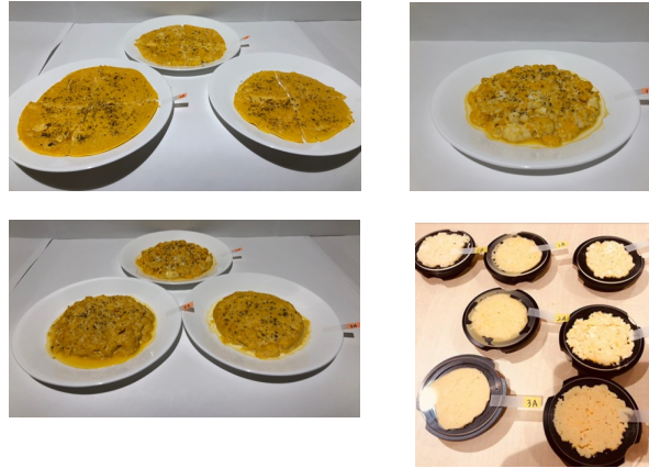
Figure.3 Cooking results of “Fuhafuha Tofu”.

uniquely determined is set as explanatory variables. In the estimation of explanatory variables, we focus on the following two perspectives. One is the existence of a quantitative expression for the foodstuff. Quantitative amount for a foodstuff can be set as an explanatory variable, if the required input of the foodstuff is not specifically specified. The second is the presence or absence of degree expressions for the cooking and processing operations. We focus on the time required for the cooking and processing operations, and the amount and intensity of the operations. For example, the heating time and heat level in the heating process, and the degree of force and stirring time in the stirring process. Here, we add that even if the specific amount and degree of manipulation are not described as quantitative expressions, the state of change of the food after the cooking and processing operation can be described specifically. For example, whipping cream until it becomes cubed, or continuing heating until the surface of the food becomes white, such descriptions can be interpreted as unambiguous expressions. In this example of “Fuhafuha Tofu”, we set the degree of mixing in "well-mixed" and the degree of heat and heating time in "simmering". In this example, the degree of mixing in "well-mixed" and the degree of heat and heating time in "simmering" were set as explanatory variables.