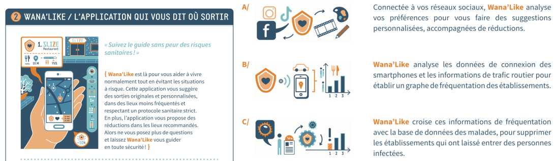
Figure 1. Extract of game card distributed to the players to describe Wana'Like - illustration © Marie Jamon

requiring more access points. Each place will need to check and debit the necessary access points; once out of points (or as long as they are infectious), the user cannot enter these places anymore.