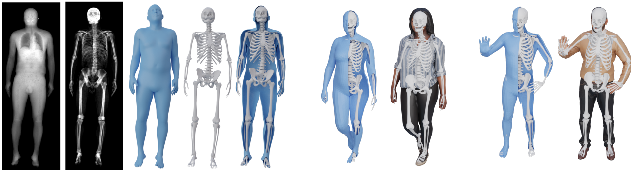
Figure 1. From DXA scans we learn to predict the skeleton from the body surface. Left: input DXA soft tissue and bone images; body and skeleton shapes fit to the images; bones predicted from the skin; overlay. Right: predicted OSSO skeletons from RenderPeople [28] scans.

3 Université Grenoble Alpes, Inria, CNRS, Grenoble INP, LJK, France