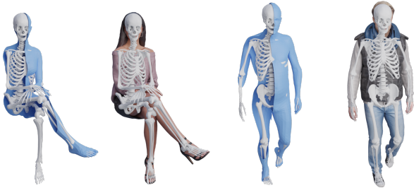
Figure 5. Qualitative evaluation of the skeleton inference in arbitrary poses. OSSO yields visually plausible results.

Although some minor skin interpenetrations remain, the obtained results are visually plausible.