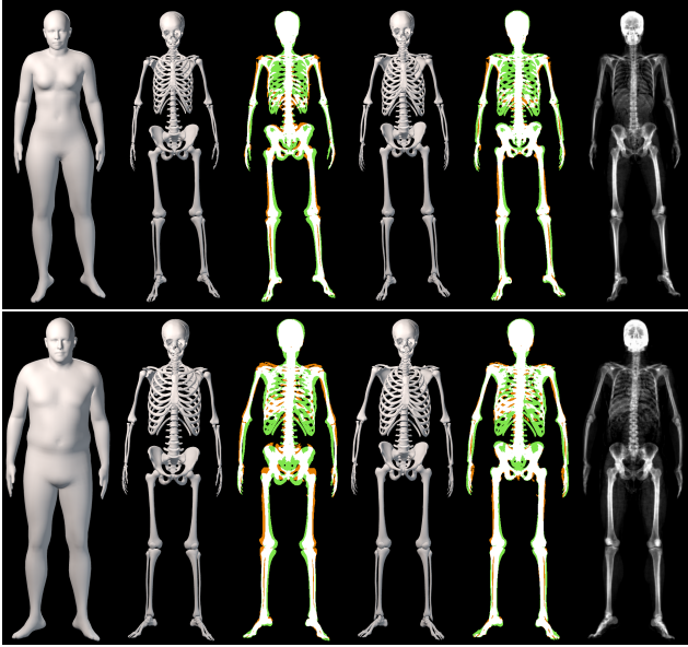
Figure 4. From left to right: input R_S , AT prediction, overlap with M_B , OSSO prediction, overlap with M_B , I_B DXA. Overlap image color code: orange is M_B only (false negative), white is the intersection of both (true positive) and green predicted only.