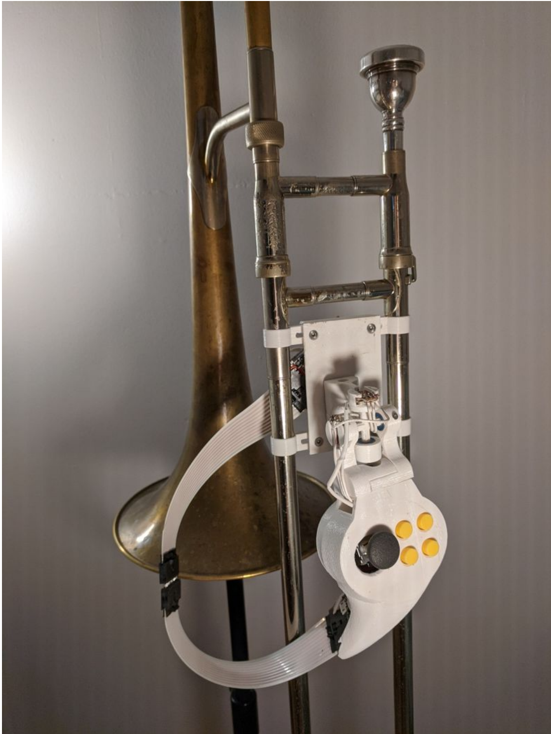
Image 2 The first version of the yoke controller.