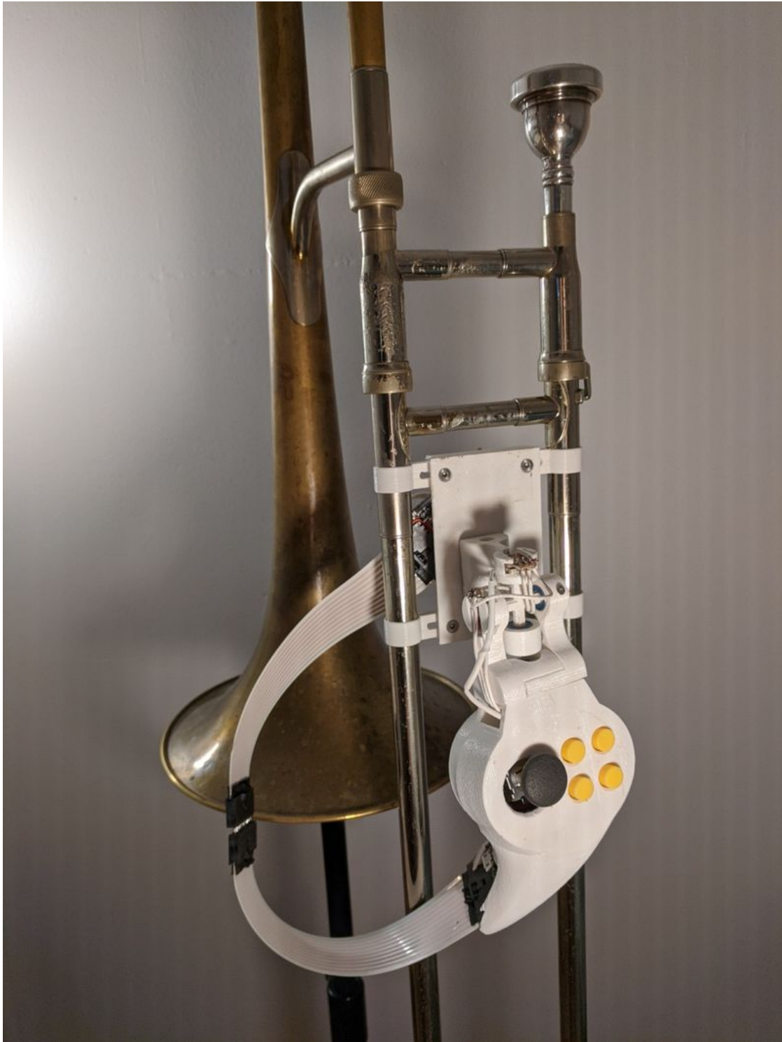
Image 2 The first version of the yoke controller.