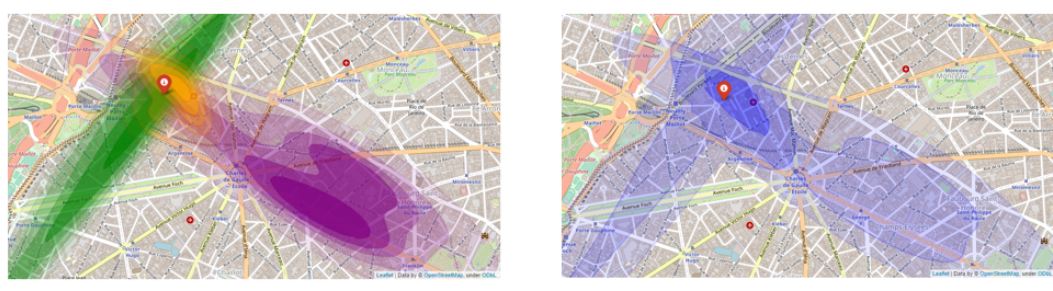
(b) Kernel Density Estimation of the Place Names