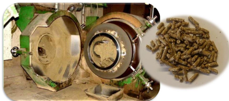
Fig. 2. Pellets after compaction in a press machine

and time, to a physical state that is more suitable for compaction. Moreover, the integrated thermal process modifies starch content and improves tastiness. By adding steam, the moisture of mixed mash increases. Because of the gaseous state of the steam, the moisture is homogeneously dispersed in the mixture. Moreover, the steam condenses uniformly on the particle surfaces and provides better lubrication of the pellet, reducing the wear and increasing the production rate. Applying too much heat or water has a negative effect on the quality of the pellet and may lead to the plugging of the press die. In Fig. 2, the feed mixture goes through a die with specific dimensions, openings, and thickness for producing desired pellets as compact cylinders.