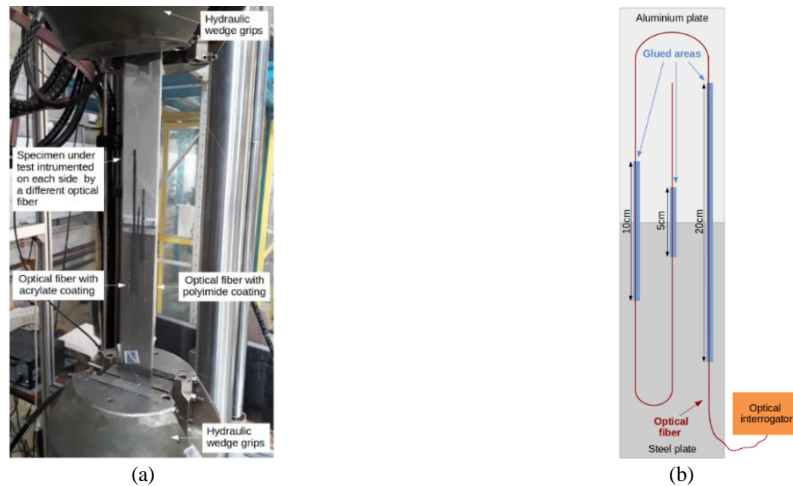
Fig. 2. Description of the experiment. (a) Photography of the instrumented specimen under tensile test. (b) Schematic presentation of the specimen instrumentation.

Fig. 3 presents the strain profiles of the polyimide and acrylate coated optical fibers for the three bonding lengths (violet curves). It can be observed that the strain profiles measured with the polyimide-coated optical fiber is composed of two clearly visible constant strain distributions, as expected, around 100\mu\text{m/m} and 300\mu\text{m/m} in the steel and aluminum plates, respectively. Note also that the level of noise (due in large part to vibrations of the hydraulic testing system) increases over the length of the optical fiber. Despite this, the maximum strain values are almost the same for three bonding lengths of polyimide-coated optical fiber. On the other hand, the acrylate-coated optical fiber gives different measurements. Firstly, the two constant strain distributions are not distinguishable and secondly, the maximum strain values in the steel and aluminum plates decreases with the bonding lengths. These phenomena are due to the strain transfer of the optical fiber which depends on the type, the number of the optical fiber coatings as well as the interface strength between themselves and with the substrate. From the measurements, it can be observed that the polyimide-coated fiber has a shorter strain transfer length than the one with an acrylate coating. For this reason, polyimide coated fiber is recommended for high resolution distributed strain measurements.