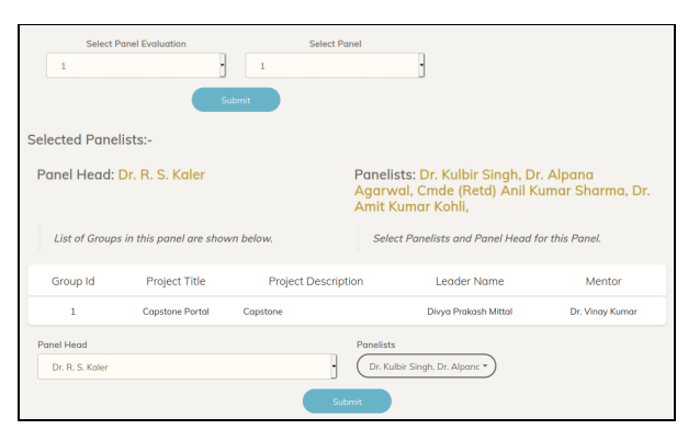
Fig 3. Setting Judging Criteria (Admin Tools)

One of the key features of the Capstone Project Management Portal was to manage the panel evaluations. This included scheduling the evaluation dates and making announcements of the same to the students and faculties. The same is taken care of through the interface provided only to the admin and course coordinators. They are provided with a functionality to decide upon the list of panelists and push an announcement regarding the dates. For the judging process, they have been provided with a feature to control the judging criteria and their weightage in the evaluations. The mentors and the judging panel are expected to follow the proposed scheme for marking students. Post evaluation the marks are fed into the portal through an interface provided. The interface for adjusting the judging criteria is shown below.