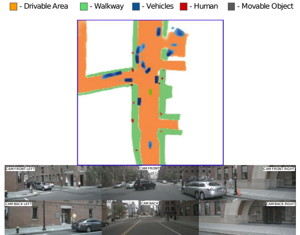
Fig. 1: Semantic grid predictions by LAPNet for classes in the NuScenes dataset [7]. By using LIDAR information to aid the projection of camera features, our method allows the creation of more precise semantic grids compared to camera-only methods. Best viewed with digital zoom.

1 Authors are with the Chroma team, INRIA Grenoble Rhone-Alpes, France. 2 Authors are with CITI-Lab, INSA Lyon, France. 3 Author is with Hacettepe University, Ankara, Turkey. Correspondence: manuel.diaz-zapata@inria.fr