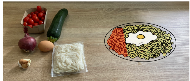
Figure 1: On the left are the ingredients and on the right is a realistic representation of the predicted amount of food that would be produced with a red overlay to designate the surplus amount compared to the recommended quantity.

She invited three friends over and is thus going to the grocery store in order to buy the necessary food items for a specific recipe she has in mind. Similar to the system studied by ElSayed et al. [3], the goods written on her shopping list are highlighted while she looks at different shelves so as not to be tempted by special offers and buy unnecessary items. When several products of the same type are available, she can compare them: the overall quantity expressed as the number of average meals for one person is displayed for each item she holds. Having 3 guests, Julia selects the one that shows 4 portions to avoid over-provisioning. However, in the next aisle, several products share the same quantity. In that case, the price and the composition are put forward instead and Julia can make a choice according to her budget and the diet of her guests.