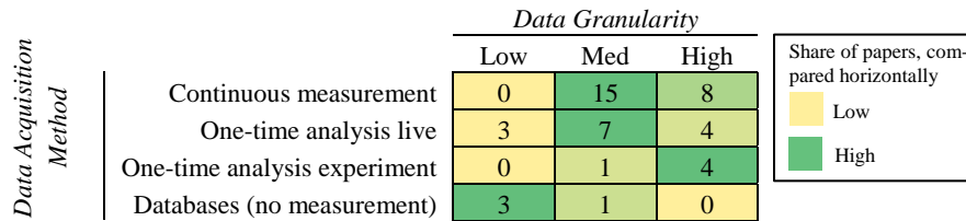
Table 2. Comparison of number of papers per data acquisition method and data granularity

Granularity is defined in Table 2 as the manufacturing level at which the data is collected. Continuous measurement and one-time analysis in live settings, mostly provide medium (machine level) granularity data, and occasionally high (component level) granularity data. Zhang et al. and Hu et al. point out that obtaining high granularity real-time data is a challenge [10, 11]. The literature review results indicate that one-time analyses in an experimental environment are used to collect high granularity data, but less for collecting lower granularity data. Woo et al. raise the issue that models based on empirical one-time data are however less reliable than those continuously using historical and real-time data [12]. Databases primarily provide only low (enterprise level) granularity data, and are mostly used for life cycle assessment analysis. Across all data acquisition methods, in 35% of the papers measurements were done on the component level, in 52% at the machine level and in 13% at the enterprise level. Very few papers covered multiple levels, even though research shows that “the extension of an analytical approach to the process and plant levels with multiple machine tools” can lead to further energy savings [13]. Few papers give reasoning for the specific data acquisition architecture, and most describe standalone solutions without significant integration into existing systems or platforms.