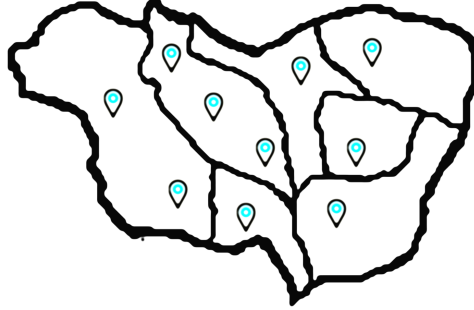
Fig. 2. The network of community medical service design problem