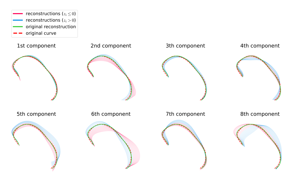
Figure 2: The nomogram illustrates the reconstruction's effect after varying a single component in the autoencoder's latent space (dim Z=8). The dashed red curve represents the original curve, the solid green curve represents the reconstruction with the original encoding, and the solid pink and blue curves represent the reconstructed curve after varying a single component in the [-1,1] interval.