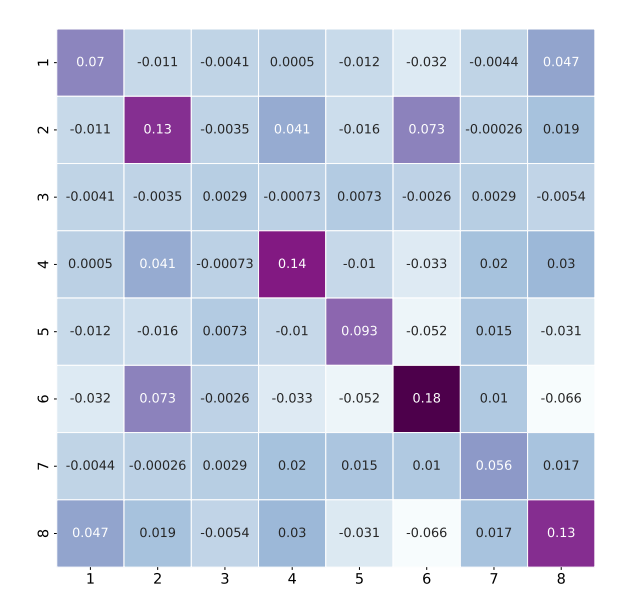
Figure 1: Autoencoder's latent space covariance matrix (dim Z=8).