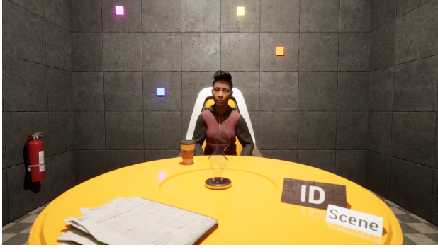
(a) The lobby.