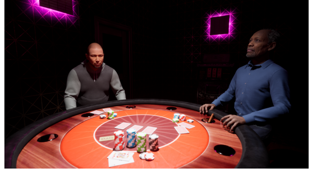
(d) Scene 3: The poker table.