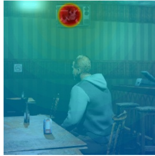
(b) The TV in the back of the bar is very attractive semantically, which is enforced using the attention map T_{att} .