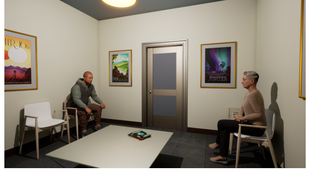
(b) Scene 1: The waiting room.