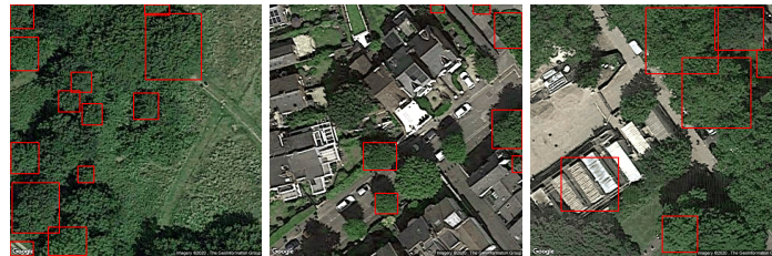
Fig. 2. Prior to Normalisation (detected trees in red bounding boxes)

The raw RGB images downloaded using Google APIs could directly be tested with these models. But, the model did not recognize much trees from the original Google images. A closer look at DeepForest model workflow reveals a RGB normalisation step. It would be useful to perform a similar normalisation on the Google images to match the functionality. Once a similar normalisation (as explained in Section 3.2) was tried, the tree recognition considerably improved. Figure 1 shows many more bounding boxes than from the original image. But, it can be seen from these images that still a lot of tree crowns are missed by the model. Prior to any further fine-tuning of the model, based on the newly collected and pre-processed dataset, the model was used to predict the collected images of the Camden borough. The resulting predictions had an average confidence score of just 31.2%. The next step to improve such a model is to fine tune the model using transfer learning techniques.