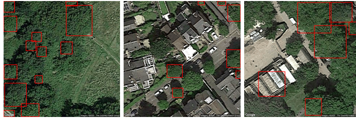
Fig. 2. Prior to Normalisation (detected trees in red bounding boxes)

The raw RGB images downloaded using Google APIs could directly be tested with these models. But, the model did not recognize much trees from the original Google images. A closer look at DeepForest model workflow reveals a RGB normalisation step. It would be useful to perform a similar normalisation on the Google images to match the functionality. Once a similar normalisation (as explained in Section 3.2) was tried, the tree recognition considerably improved. Figure 1 shows many more bounding boxes than from the original image. But, it can be seen from these images that still a lot of tree crowns are missed by the model. Prior to any further fine-tuning of the model, based on the newly collected and pre-processed dataset, the model was used to predict the collected images of the Camden borough. The resulting predictions had an average confidence score of just 31.2%. The next step to improve such a model is to fine tune the model using transfer learning techniques.