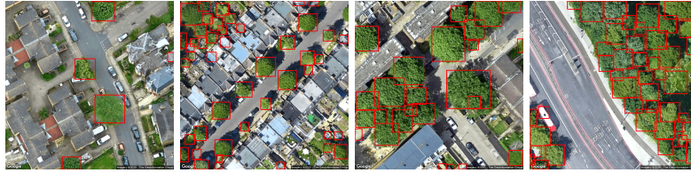
Fig. 3. Positive Results with Self Supervised Model (trees in red bounding boxes)