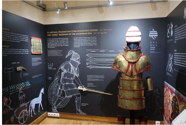
Fig. 1: A view of the “Hero” Warrior of the Mycenaean Period’ gallery, showing the combination of reconstructed objects and rich interpretive material.

Our work is related to [2], where a real-world dataset of visitor pathways was collected at Melbourne Museum (Melbourne, Australia). It suggests that utilising walking and semantic distances between exhibits enables more accurate predictions of a visitor's viewing times of unseen exhibits than using distances derived from observed exhibit viewing times. The time tracking was referring to exhibit areas, while in our approach we measured individual exhibits.