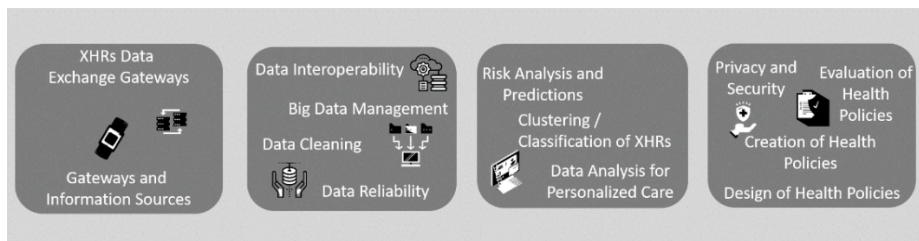
Fig. 2. Supported system functionalities

The proposed system provides several mechanisms with specific functionalities in order to support the creation of XHRs, Networks of XHRs and the formulation of Public Health Policies.