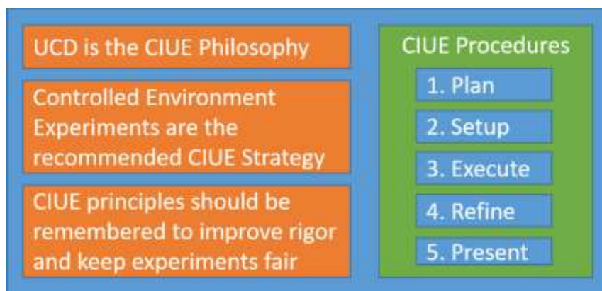
Fig. 2. CIUE components.