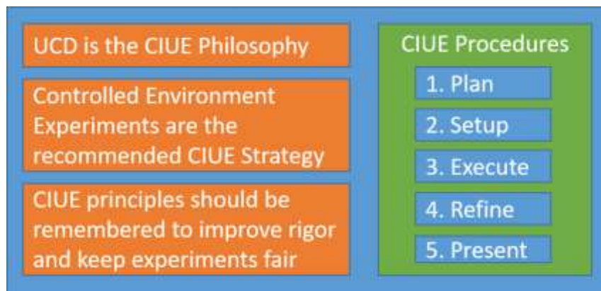
Fig. 2. CIUE components.