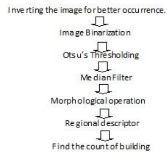
Fig. 2. Flow of Extraction process

The process of building exaction can divide in to three sections 1. Preprocessing, 2.separating buildings from the background and 3.will count the building and building area. The proposed method of flow is given below: