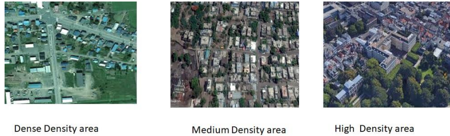
Fig. 1. Building densities