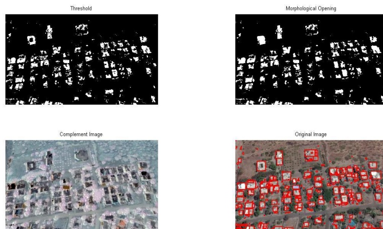
Fig. 4. Samarth Nager