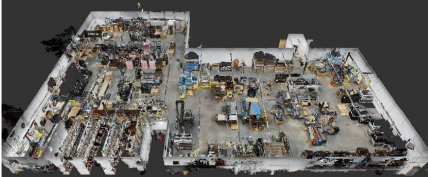
Figure 2. Areal view of the shopfloor with 3D scanning photogrammetry (a) and structure light (b) type

Moreover, it is worth mentioning that 3D scanning has been used in a master level course to allow the students to have a digital Gemba of a warehouse during pandemic times and to provide digital safety tours for new lab users, but this won't be discussed in this work.