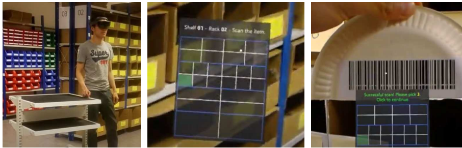
Figure 3. Details of the pick-by-vision

Thanks to this teaching material, students at bachelor level have the possibility to learn how smart glasses can serve as Poka-Yoke for error proof order picking operations, which represent the most time-consuming, labor-intensive and expensive activities for most warehouses [12]. Specifically, they have the possibility to reflect on the advantages of a pick-by-vision solution compared to the traditional paper-based order picking system. Moreover, thanks to this learning material, students learn also how to carry out cost-benefit analyses. Students are in fact shown through a case study where different customer demands are simulated how to compare the pick-by-vision solution to other innovative order picking systems (i.e., are barcode handheld, RFID tags handheld, pick-by-voice, pick-by-light and RFID pick-by-light systems) from both productivity and economic perspectives in order to determine when it is convenient to adopt the pick-by-vision solution. An example of a student using the pick-by-vision solution for order picking operations is reported in Figure 3.