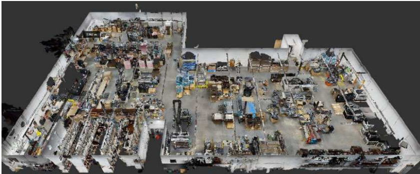
Figure 2. Areal view of the shopfloor with 3D scanning photogrammetry (a) and structure light (b) type

Moreover, it is worth mentioning that 3D scanning has been used in a master level course to allow the students to have a digital Gemba of a warehouse during pandemic times and to provide digital safety tours for new lab users, but this won't be discussed in this work.