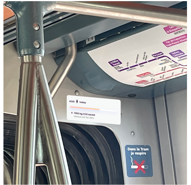
Figure 2: Example of an envisioned situated visualization facilitating eco-friendly behaviors by showing the numbers of passengers of a tramway with the amount of carbon dioxide saved compared to cars. It is placed directly inside the corresponding tramway.

Facilitating eco-friendly behavior: Often it is hard for people to know if a specific behavior can make a non-trivial positive or negative difference on the environment, which of several behaviors would be the most eco-friendly, or how to concretely implement an eco-friendly behavior. Our corpus of ideas includes several designs meant to address these issues, such as situated visualizations showing information to help locate infrastructure, such as trash cans or public transportation stops, or to help compare the energy efficiency of public transport with individual transport options (see Fig. 2).