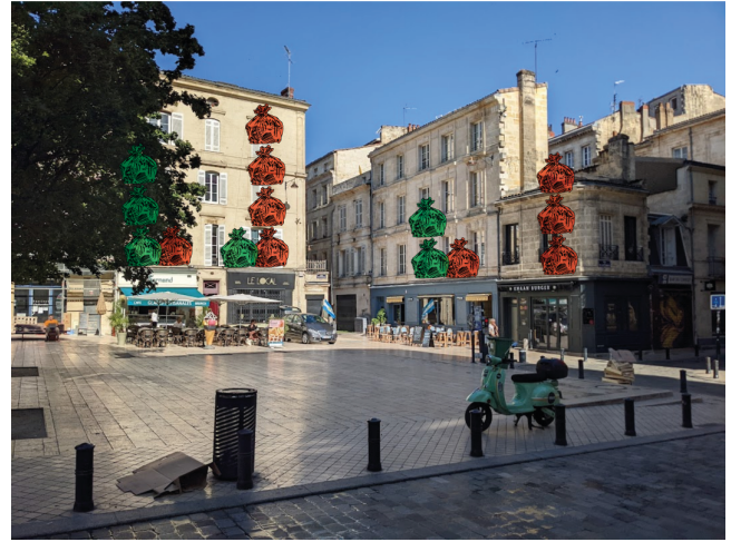
Figure 5: Example of an envisioned situated visualization increasing awareness and representing the amount of recycling trash (green) compared to regular trash (red). It is placed onto buildings from which the data is retrieved.

have the ability to promote positive social feelings and behavior, but, because they can facilitate comparison between people and groups, they also have the ability to increase social pressure.