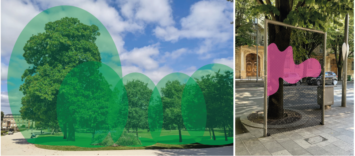
Figure 1: Examples of situated visualizations envisioned during the workshop. On the left, each green bubble represents the positive effect the trees have on the atmosphere and on oxygen production. On the right, the proportion of carbon dioxide in the air is displayed and updated every time a vehicle passes behind.