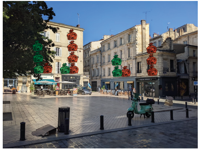
Figure 5: Example of an envisioned situated visualization increasing awareness and representing the amount of recycling trash (green) compared to regular trash (red). It is placed onto buildings from which the data is retrieved.

have the ability to promote positive social feelings and behavior, but, because they can facilitate comparison between people and groups, they also have the ability to increase social pressure.