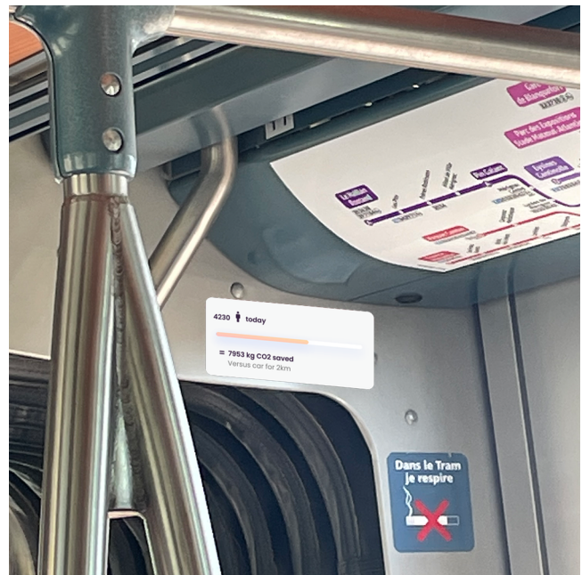
Figure 2: Example of an envisioned situated visualization facilitating eco-friendly behaviors by showing the numbers of passengers of a tramway with the amount of carbon dioxide saved compared to cars. It is placed directly inside the corresponding tramway.

Facilitating eco-friendly behavior: Often it is hard for people to know if a specific behavior can make a non-trivial positive or negative difference on the environment, which of several behaviors would be the most eco-friendly, or how to concretely implement an eco-friendly behavior. Our corpus of ideas includes several designs meant to address these issues, such as situated visualizations showing information to help locate infrastructure, such as trash cans or public transportation stops, or to help compare the energy efficiency of public transport with individual transport options (see Fig. 2).