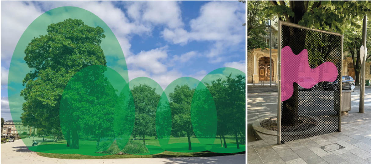
Figure 1: Examples of situated visualizations envisioned during the workshop. On the left, each green bubble represents the positive effect the trees have on the atmosphere and on oxygen production. On the right, the proportion of carbon dioxide in the air is displayed and updated every time a vehicle passes behind.