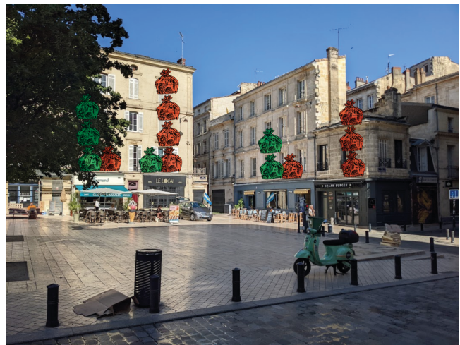
Figure 5: Example of an envisioned situated visualization increasing awareness and representing the amount of recycling trash (green) compared to regular trash (red). It is placed onto buildings from which the data is retrieved.

have the ability to promote positive social feelings and behavior, but, because they can facilitate comparison between people and groups, they also have the ability to increase social pressure.