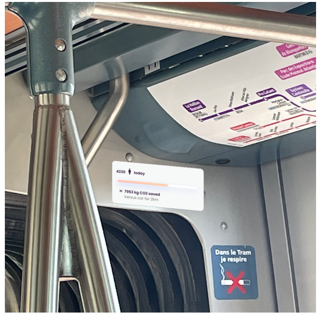
Figure 2: Example of an envisioned situated visualization facilitating eco-friendly behaviors by showing the numbers of passengers of a tramway with the amount of carbon dioxide saved compared to cars. It is placed directly inside the corresponding tramway.

Facilitating eco-friendly behavior: Often it is hard for people to know if a specific behavior can make a non-trivial positive or negative difference on the environment, which of several behaviors would be the most eco-friendly, or how to concretely implement an eco-friendly behavior. Our corpus of ideas includes several designs meant to address these issues, such as situated visualizations showing information to help locate infrastructure, such as trash cans or public transportation stops, or to help compare the energy efficiency of public transport with individual transport options (see Fig. 2).