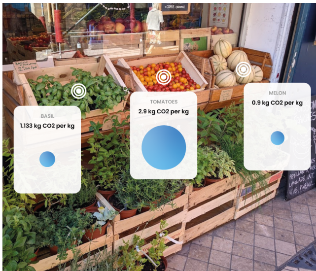
Figure 3: Example of an envisioned situated visualization informing purchasing decisions by allowing the comparison of different food items based on the carbon dioxide footprint. It is displayed directly near the corresponding food products.

Although the knowledge viewers gain may help them make decisions later in life (e.g., vote for a specific public policy), the visualizations were not meant for immediate personal action. Examples include visualizations showing how much CO 2 is stored in a specific tree or how much it can capture over a year (see Fig. 4).