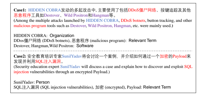
Fig. 1. Examples of the Chinese cybersecurity NER dataset. Organization (ORG), Relevant Term (RT), Software (SW), and Person (PER) are categories of cybersecurity dataset entities.

English NER [5, 18] research is much more than Chinese NER [16]. Compared with English NER, Chinese named entities are more challenging to identify due to their uncertain boundaries and complex composition. In this paper, we focus on Chinese cybersecurity NER. As shown in Fig. 1, compared with Chinese general NER tasks, entity extraction in the cybersecurity domain is a challenging task mainly because Chinese cybersecurity texts are often mixed with English entities, such as person, hacker organizations, and security-related entities (e.g., DDOS僵尸网络(botnets), SQL注入漏洞(injection)).