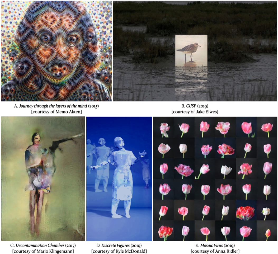
Fig. 1. Examples of artworks by each of the five artist interviewed in this article: A. Journey through the layers of the mind by Memo Akten [Photo Courtesy: Memo Akten], showing the poetry of what is happening inside the algorithm; B. CUSP by Jake Elwes [Photo Courtesy: Jake Elwes] where the machine learns qualities of different marsh birds; C. Decontamination Chamber by Mario Klingemann [Photo Courtesy: Mario Klingemann] showing machine ‘learning’ bodies and identities in order to reveal blurred shapes and colours; D. Discrete Figures by Kyle McDonald, Daito Manabe and Motoi Ishibashi [Photo Courtesy: Kyle McDonald] explores the interrelationships between the performing arts and machine learning; E. Mosaic Virus by Anna Ridler [Photo Courtesy: Anna Ridler] shows a grid of continually evolving AI-generated tulips in bloom, bringing together ideas around capitalism, value, and collapse from different points in history.

relevant for the study. Once we agreed on the codes, we organized the codes under themes that we defined ourselves. This step of developing the themes was first done by each of us independently. We then put the themes together and discussed them to reach a consensus. We extracted 8 themes that we organized under two sections.