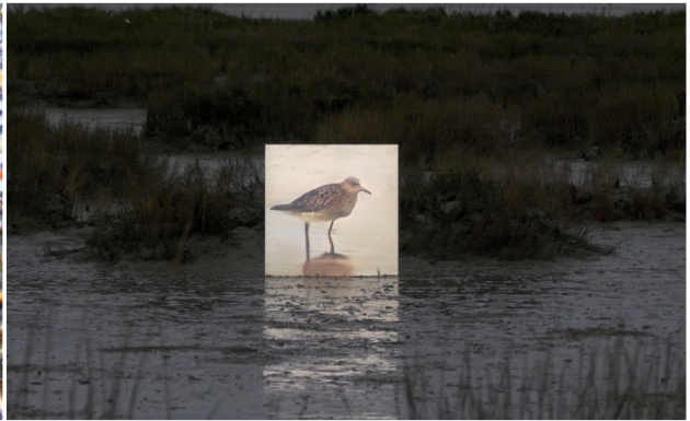
B. CUSP (2019)