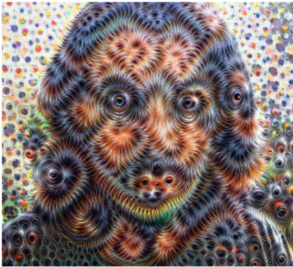
A. Journey through the layers of the mind (2015) [courtesy of Memo Akten]

344 345 346 347 348 349 350 351 352 353 354 355 356 357 358 359 360 361 362 363 364 365 366 367 368 369 370 371 372 373 374 375 376 377 378 379 380 381 382 383 384 385 386 387 388 389 390 391 392