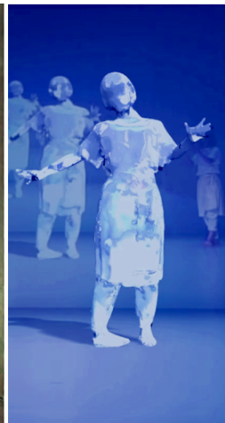
D. Discrete Figures (2019)