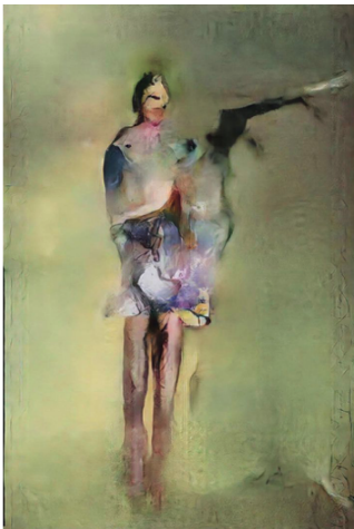
C. Decontamination Chamber (2017)