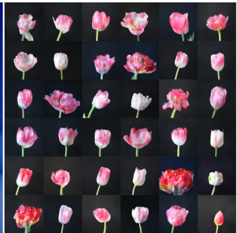
E. Mosaic Virus (2019)