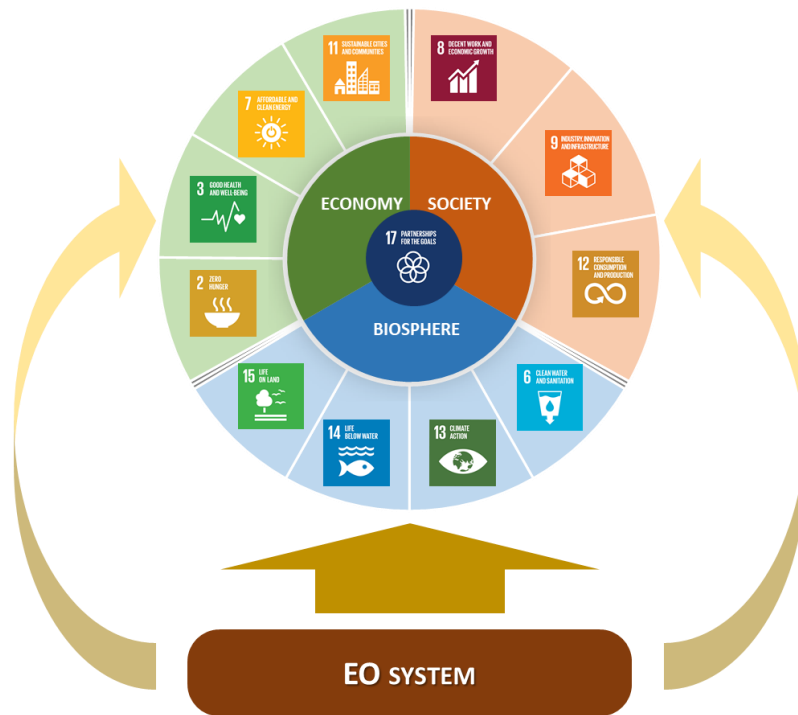
Fig. 1. The impact of EO systems on the SDGs (in accordance with [2])

Figure 1 shows the impact of EO systems on the SDGs grouping to three main facets – Biosphere, Economy, and Society. EOs provide accurate and reliable information which is directly necessary for monitoring and management of Biosphere sectors, but also have an indirect influence on the economic sectors and many activities of the society.