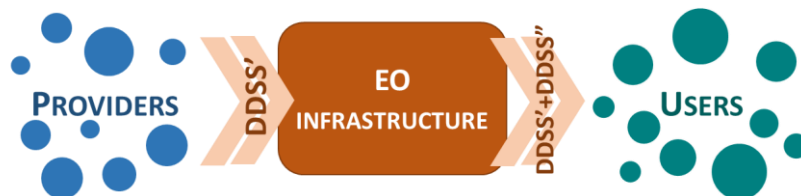
Fig. 2. DDSS Flow from Data Providers to Users

These elements – data, data products, software, and services (DDSS) are the production that can be served to the users through the infrastructure of the EO center (Fig. 2).