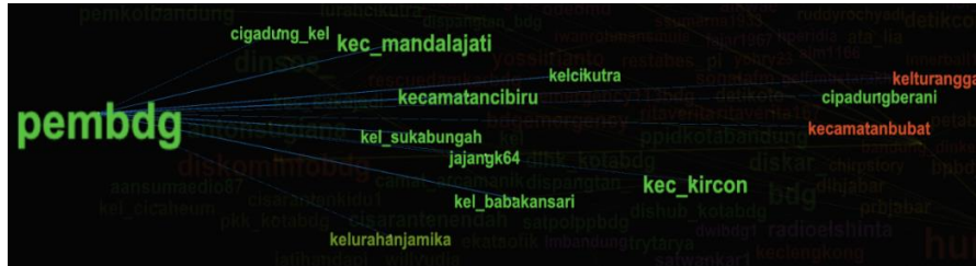
Fig. 1. Closer look of @pembdgd account in-degree network graph on 20 March 2018 flood