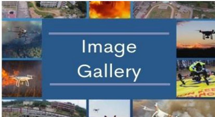
Fig. 2. Screen for image capture in Drones to the Rescue.

Drones to the Rescue was developed to be a tool for viewing the images obtained by drones. This tool allows the editing of images, the insertion of comments and perceptions of specialists involved, and being collaborative. Figure 2 presents the tool's screen and allows users to interact, supporting the decisions of specialists in emergency situations.