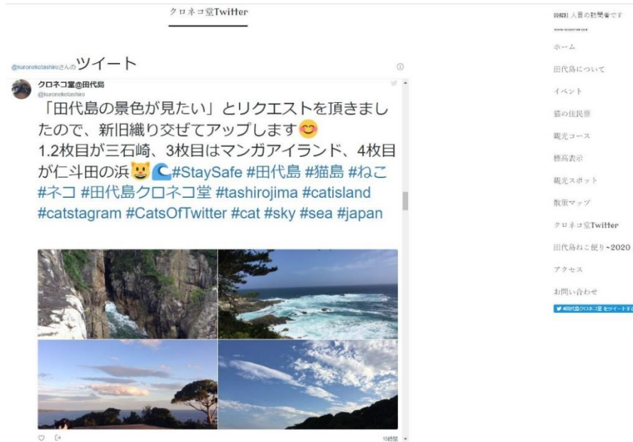
Fig. 5. Pages for the viewing function of the information submitted by Twitter