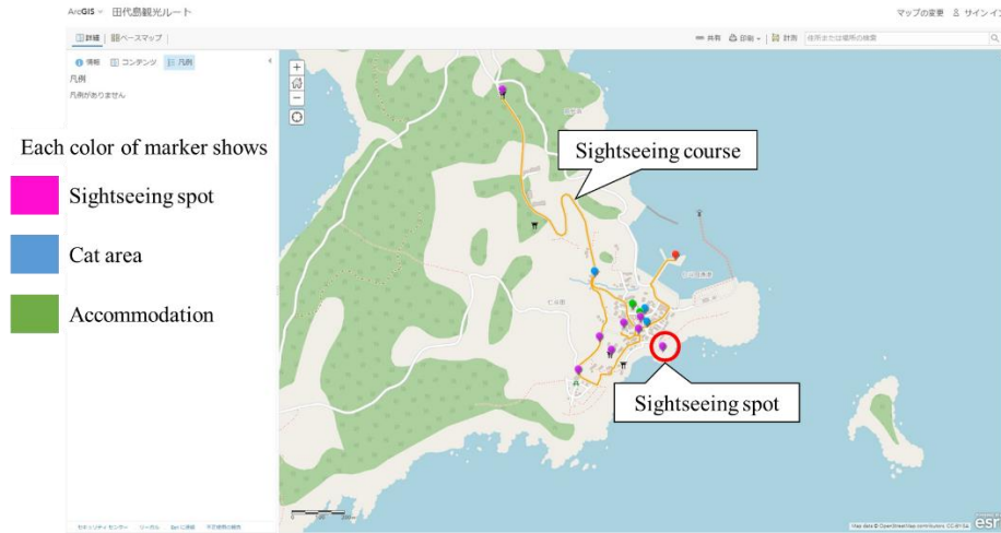
Fig. 2. Page for the display function of sightseeing course