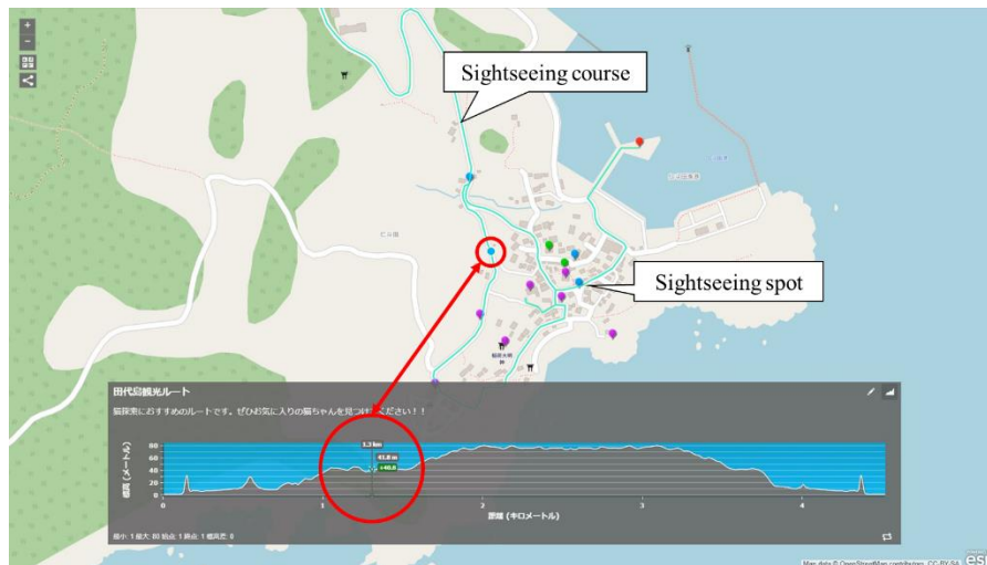
Fig. 3. Page for the display function of the elevation difference of sightseeing course

After confirming the outline of selected sightseeing course, by clicking its line on the digital map, users can go to the page for the display function of the elevation difference of sightseeing course (Fig. 3) to confirm the elevation difference. In the graph shown in Fig. 3, the vertical axis indicates elevation [m], and the horizontal axis indicates the distance [km]. By moving the cursor in the graph, the location corresponding to the sightseeing course is displayed by a blue circle.