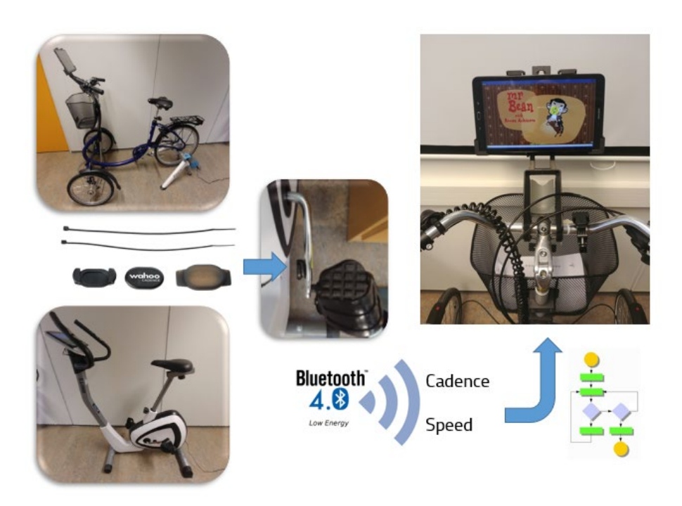
Fig. 1. Set up of the in-door bycycle based activity monitor.

Proposed solution #2: Guided out-door exercise. The second solution provides a tool for people with intellectual disability to make them more physically active in mild to moderate intensities (walking and hiking). The technical solution is a mobile application that can be used anywhere and is tailored for a user group that previously have had no specially tailored solution with the same objective.