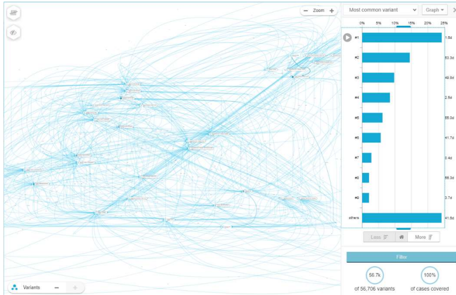
Fig. 4. Process deviations report in Celonis for the usage of SAP S/4 HANA.